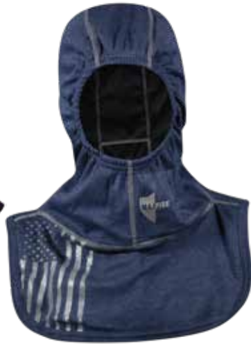
HALO 360 NB NVDARK FI FREEDOM