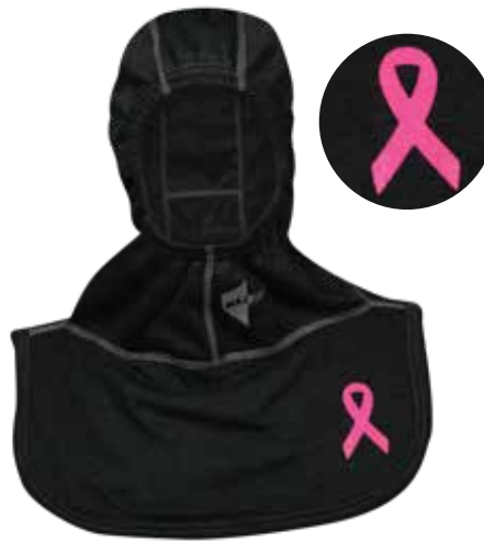
HALO 360 NB BLK FI PINK RIBBON