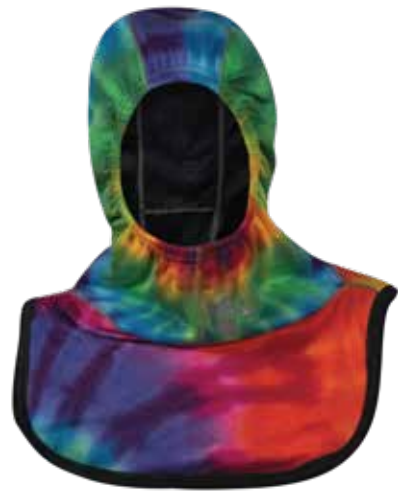
HALO 360 TD MULTI