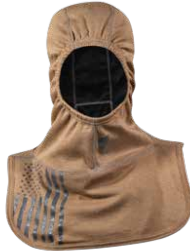
HALO 360 NB TAN FI FREEDOM