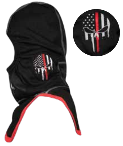
HALO 360 NB BLACK EMB PUNISH RL