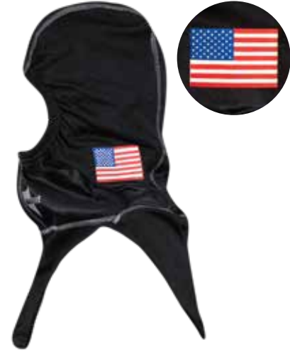
HALO 360 NB BLACK EMB FLAG