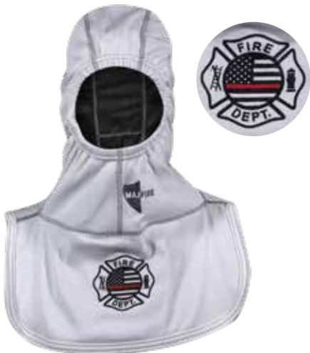
HALO 360 NB FI MALTESE RL